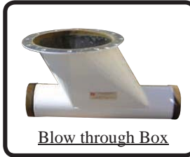
Blow through Box