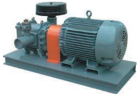
Standard Equipment for Transfer System