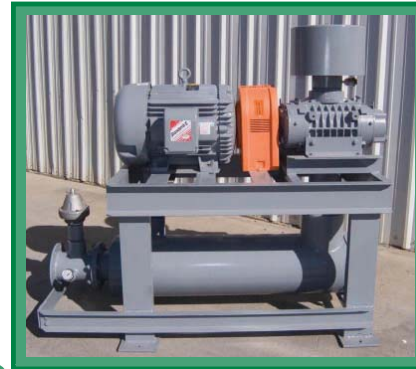
AirMac Blower System (shown with silencers)