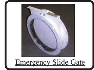
Emergency Slide Gate