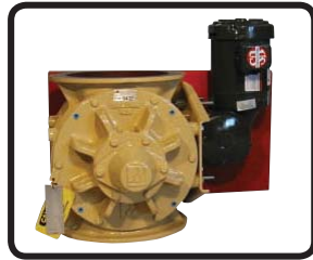
Rotary Vane Feeder